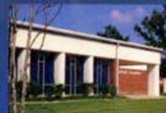
Jackson County Campus