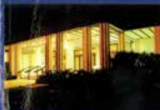
Jefferson Davis Campus