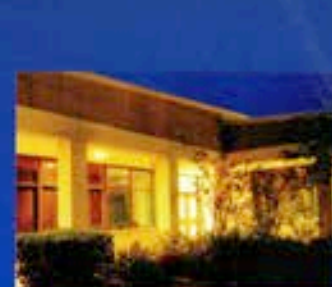
Applied Technology & Development Center