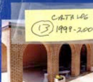
George County Center