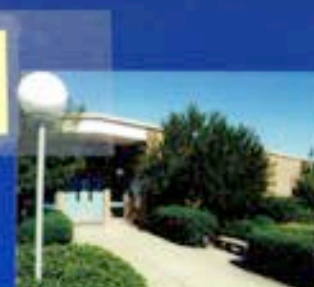
W. Harrison County Center