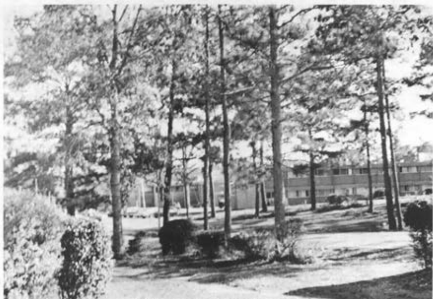
PERKINSTON CAMPUS SCENE