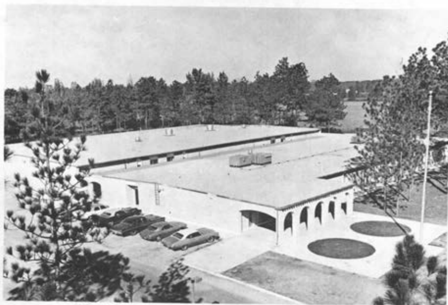
GEORGE COUNTY OCCUPATIONAL TRAINING CENTER

With the near-100 per cent placement record established nationally in vocational education, the center renders a valuable service to the area.