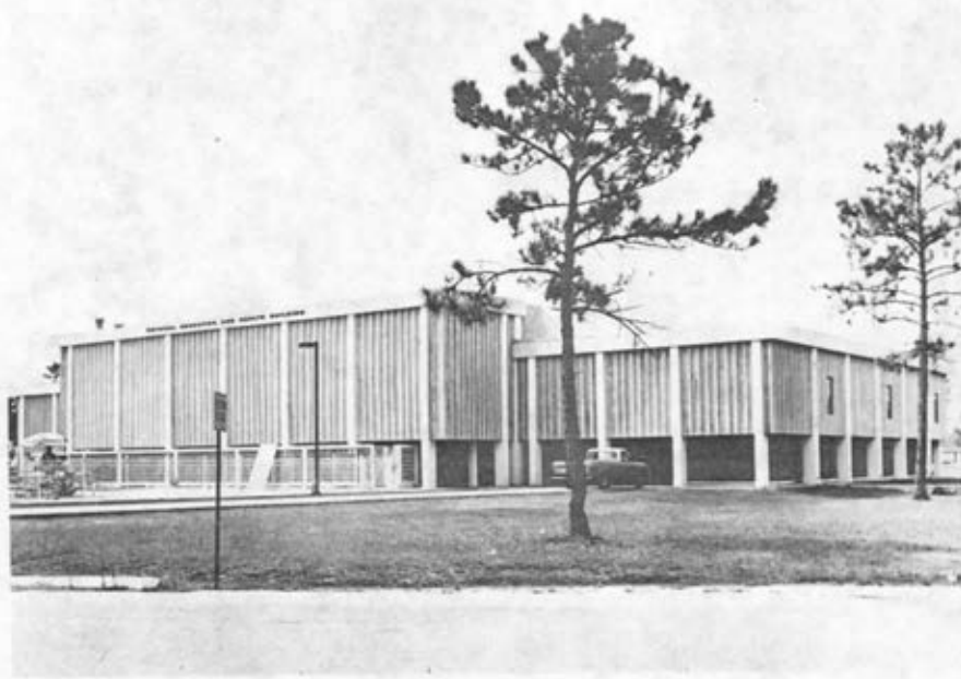
PHYSICAL EDUCATION BUILDING - JACKSON COUNTY CAMPUS

With the exception of certain courses in specialized areas, the three campuses offer essentially the same basic instructional program. Course numbers and descriptions in the catalog, course outlines, text books, and supplementary materials apply to all campuses. Where courses differ the campus on which the course is taught will be designated. Close departmental coordination among campuses helps insure all students optimum uniformity of instructional quality.