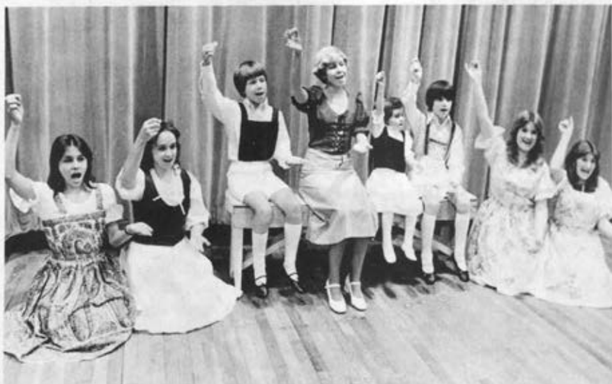
THE SOUND OF MUSIC PERK PLAYERS