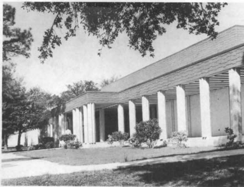
FINE ARTS BUILDING - JEFFERSON DAVIS CAMPUS

In the next decade, the college is expected to invest an estimated $12 million in new construction. In doing so, it hopes to provide the most modern classroom and laboratory facilities -- academic, vocational and technical -- and to furnish them with the most up-to-date equipment available.