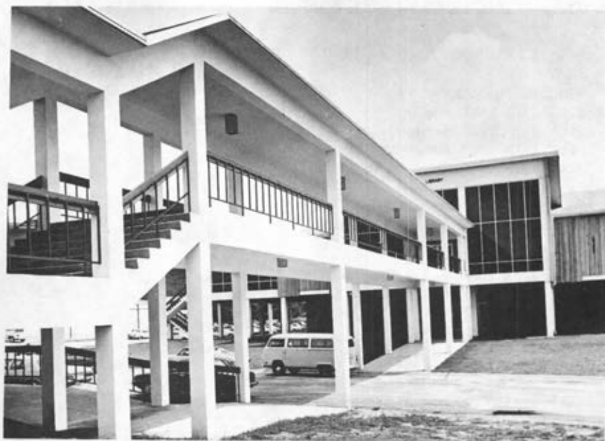
LIBRARY - JACKSON COUNTY CAMPUS

NOTE: MAT 1815, 2425, 2433 may be substituted for MAT 1613, 1623, 2613, 2623.