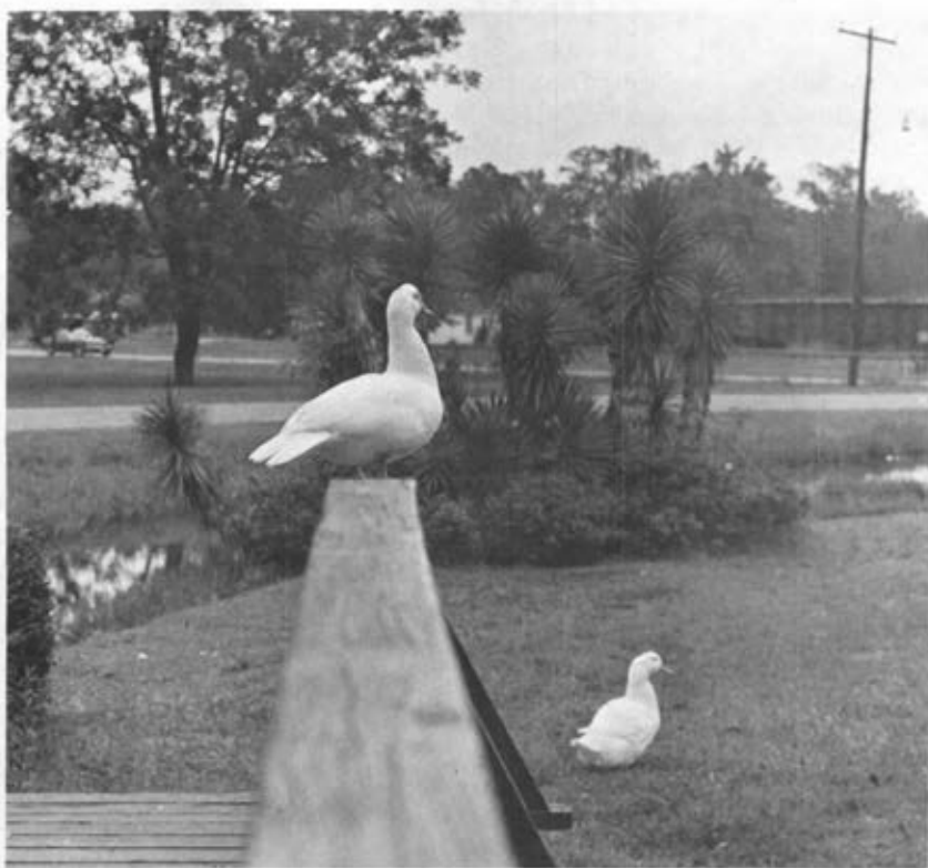
PET DUCKS - PERKINSTON CAMPUS