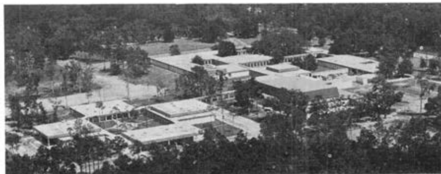
Aerial view of Jefferson Davis Campus at Handsboro.

In compliance with Title V of the Civil Rights Act of 1964, the Board of Trustees of Mississippi Gulf Coast Junior College has adopted a policy assuring that no one shall, on the ground of race, color, or national origin, be excluded from participation in, be denied the benefits of, or otherwise be subjected to discrimination, in any program or activity of the college.