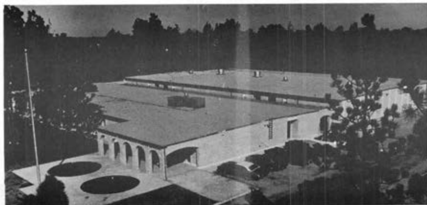
Aerial view of George County Occupational Training Center at Lucedale.

Another phase of Adult Occupational Education is Occupational Extension Classes which are designed to assist employed persons in keeping abreast of new developments in their occupations and to provide an opportunity for