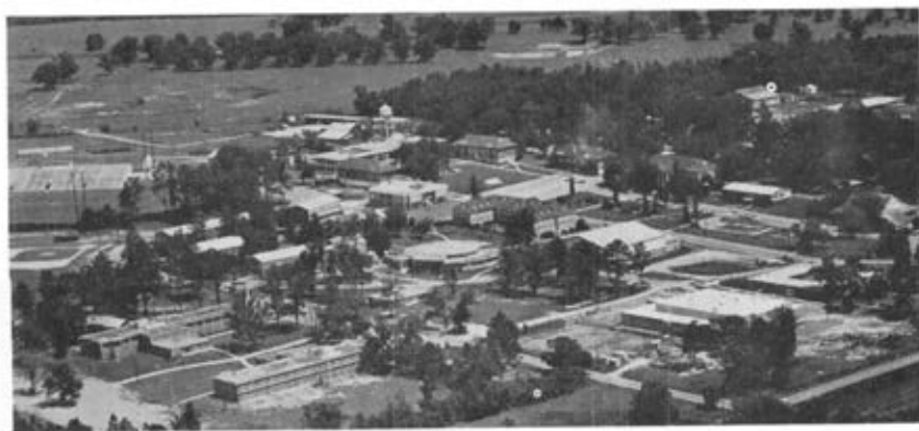
Aerial view of Perkinston Campus at Perkinston.