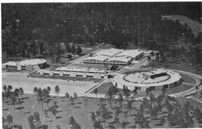
Aerial view of Jackson County Campus at Gautier.